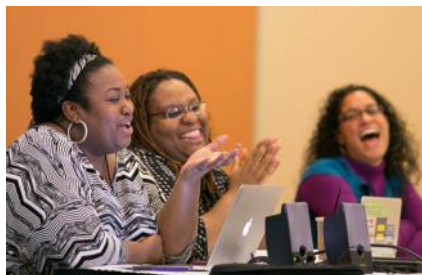
The Crunk Feminist Collective.