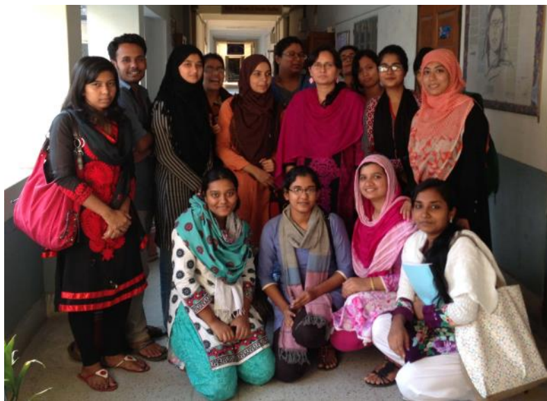
My wonderful students from the "Introduction to Feminist Theories" class.

and articles that my professors assigned were written by North American or European feminists in English. I looked at the syllabus I was teaching. I assigned some amazing feminist texts from scholars such as Judith Butler, Audre Lorde, and Chandra Mohanty and all of the works were published in English from either the USA or the UK. My own academic training in Bangladesh and the way I was training Bangladeshi students were heavily influenced by feminist knowledge produced in the hegemonic Global North. My colleagues at University of Dhaka try their best to update students with most recent interventions in North American and European