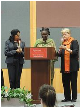
Closure of the symposium.

The morning started with a panel on Women's Rights, moderated by Prof. Zakia