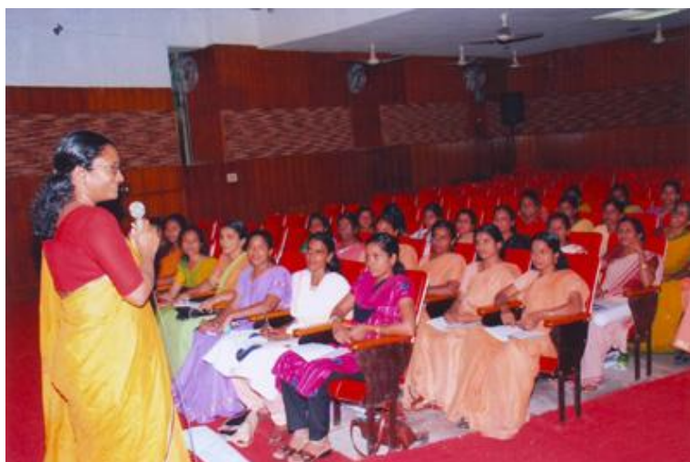
Training on performance improvement at Kudumbashree.

Kudumbashree will provide a definite amount to the hostess for a period of 6 months by which time the woman will be imparted a skill with which she will be reintegrated into the labor market and into the Kudumbashree Neighborhood Group and she will move out of the Accredited Safe Home. The skilling of the woman will be accomplished through the Aajivika skill development program of the Ministry of Rural Development or under the National Urban Livelihood Mission. This will be implemented by the qualified service providers of the Gender Help Desks of Kudumbashree which also house short-stay homes. Reintegration into the neighborhood group is so very important since the group provides the collective space in which women find their strength, identity and collective voice. ☘