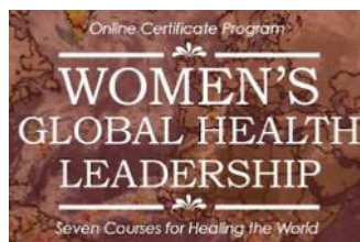
Logo of the program.

education requirements or moving towards completion of a Bachelor's degree. The twenty-one credit certificate program offers a combination of required, elective, and special