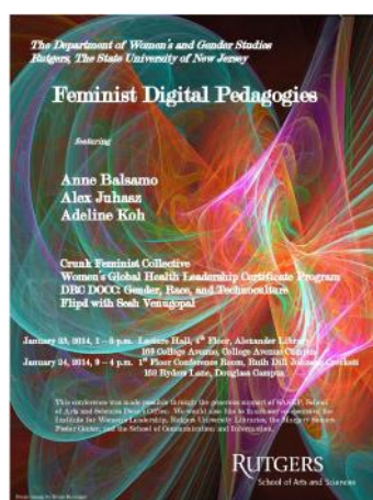
Poster of the conference.